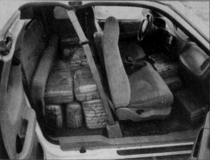
More than 1,000 pounds of marijuana was found in this vehicle by a Pinal County sheriff's deputy.